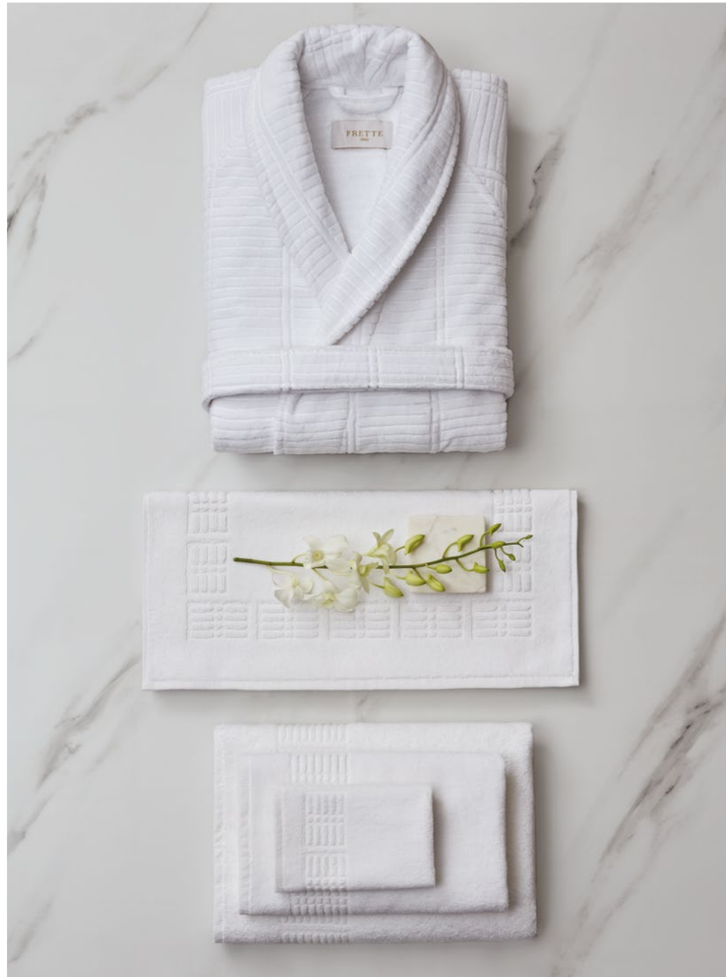
Agata Jacquard Velour Bathrobe , 100% Cotton. White colour. Agata Towel Set and Bath Mat , 100% Cotton, Double Twisted Terry, Jacquard Design on border. White colour.