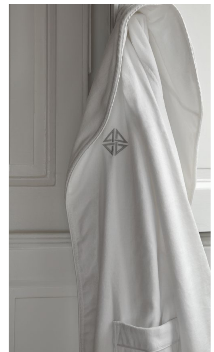
Smeraldo Sateen , Plain Design, 100% Cotton, Mercerized. White colour with Grey Cliff applied borders. Ravenna Decorative Cushion and Bed Cover , 100% Cotton Pique, Mercerized. White colour. Quilted Velvet Decorative Cushion , 100% Polyester, Grey Cliff colour. Velour Bathrobe with White Piping , 100% Cotton. White colour.