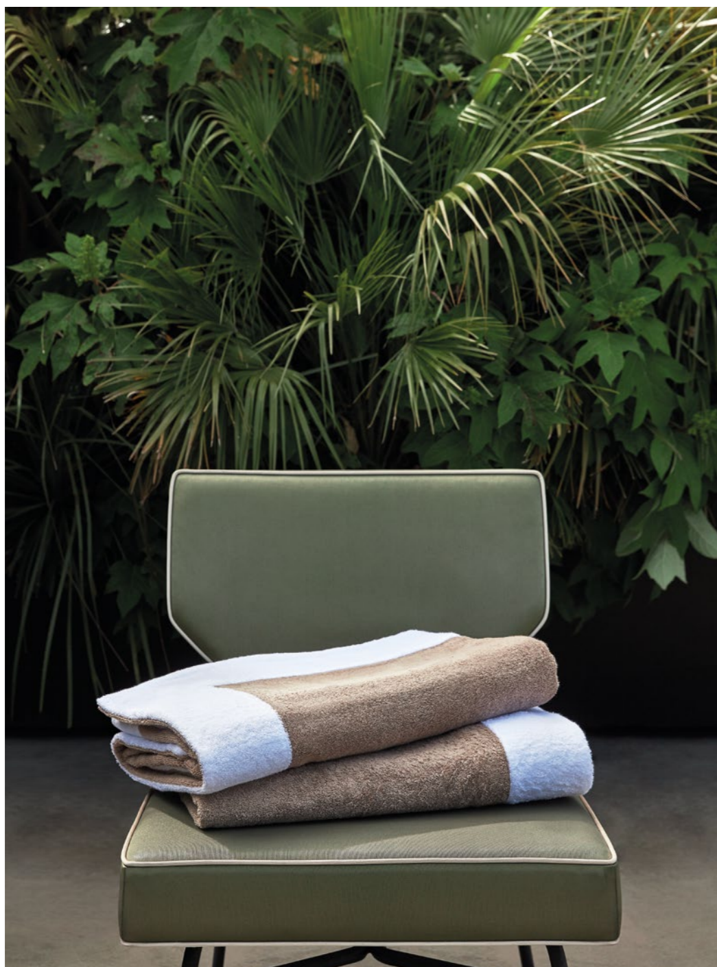
Mediterraneo Beach and Pool Towel , 100% Cotton, Single Twisted Terry, Vat colour, Applied White Single Twisted Terry Border, Mitred Corners. Taupe/White and Navy/White colours.