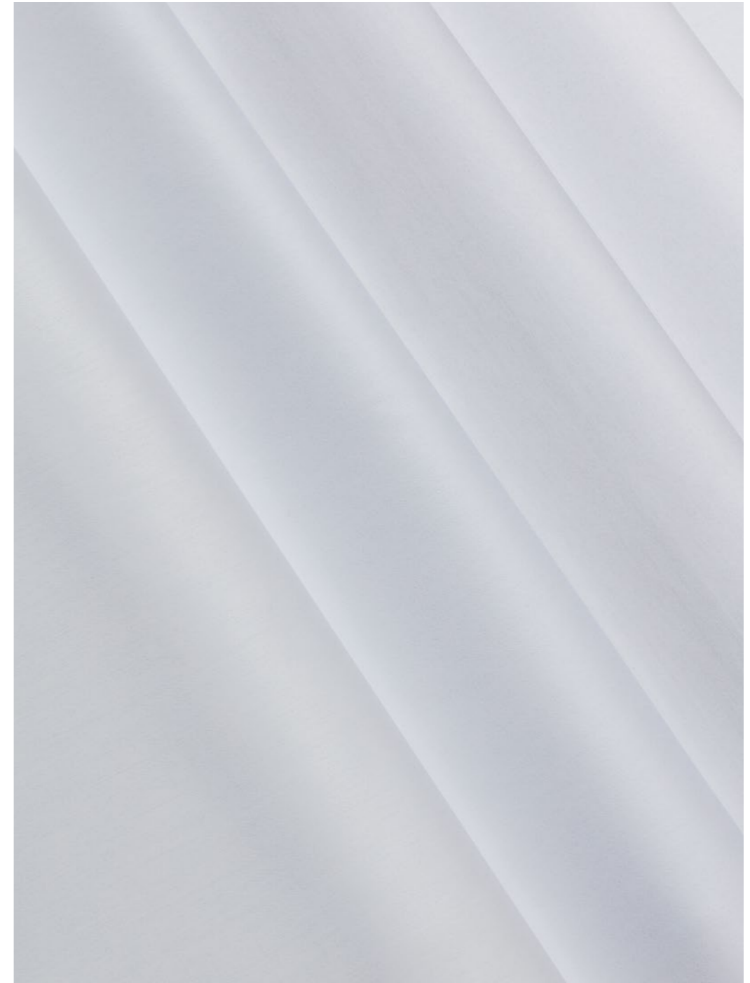
Mille Sateen, Plain Design, 100% Cotton, Mercerized. White colour.