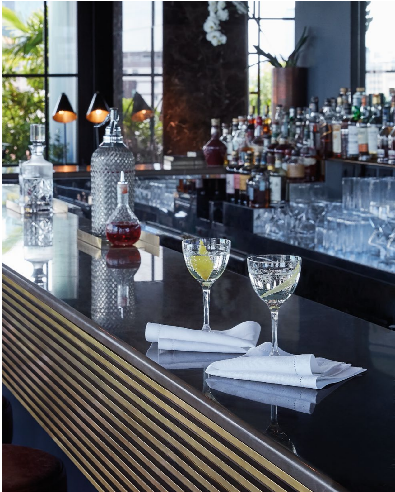
Benaco Cocktail Napkin, Linen/Cotton, Plain Weave, Hemstitch. White colour.