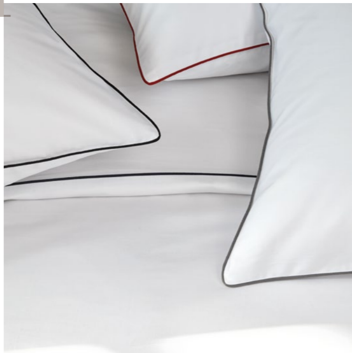
Smeraldo Sateen, Plain Design, 100% Cotton, Mercerized. White colour. Trim on edges. Grey, Blue, Black and Red colours. Partout Decorative Cushion, 100% Polyester, Black/Ink Blue colour.