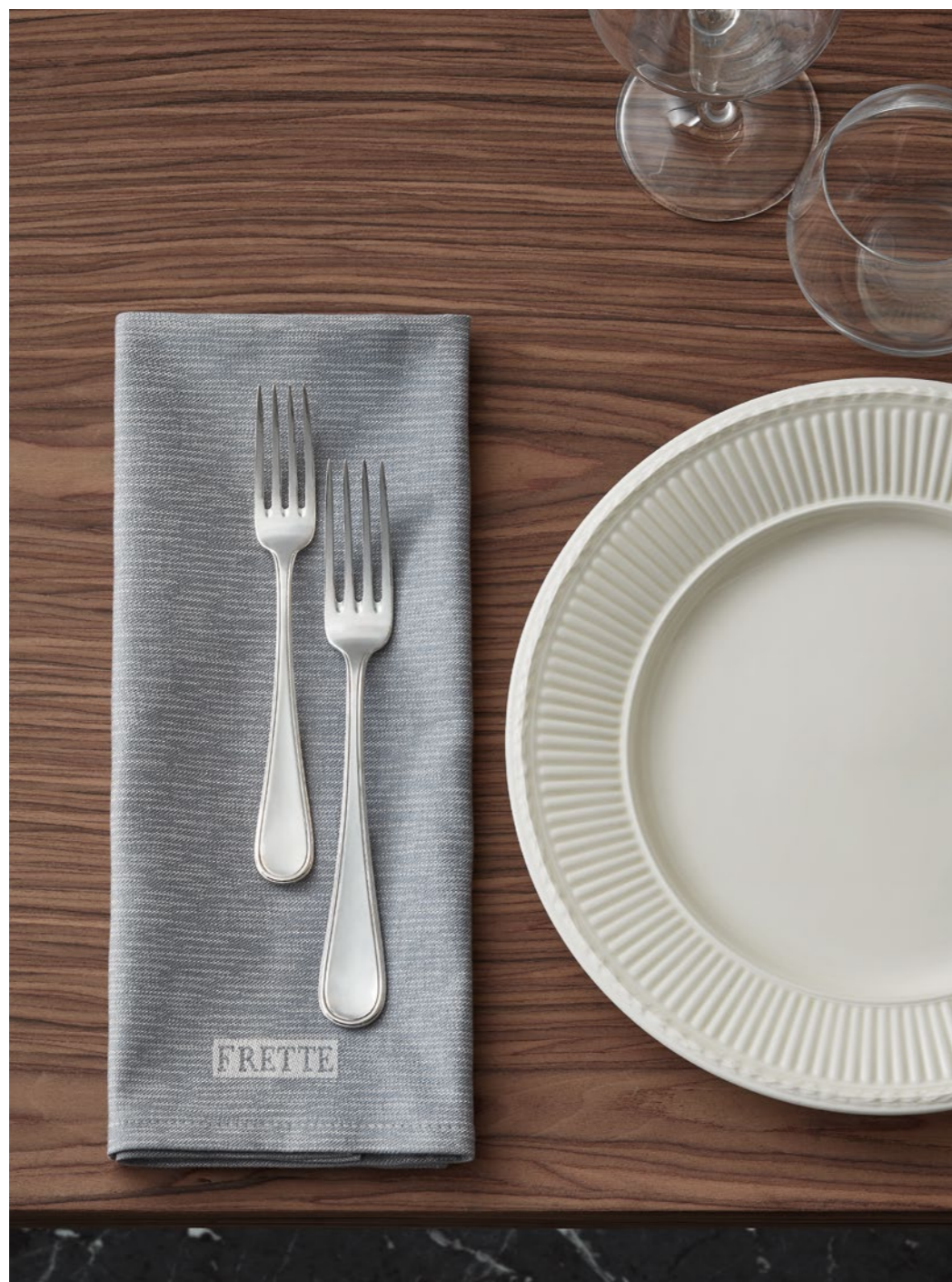
Valeria Napkin , 100% Cotton, Full Tone Warp, Grey/Ivory Vat colour. Inwoven Frette logo.