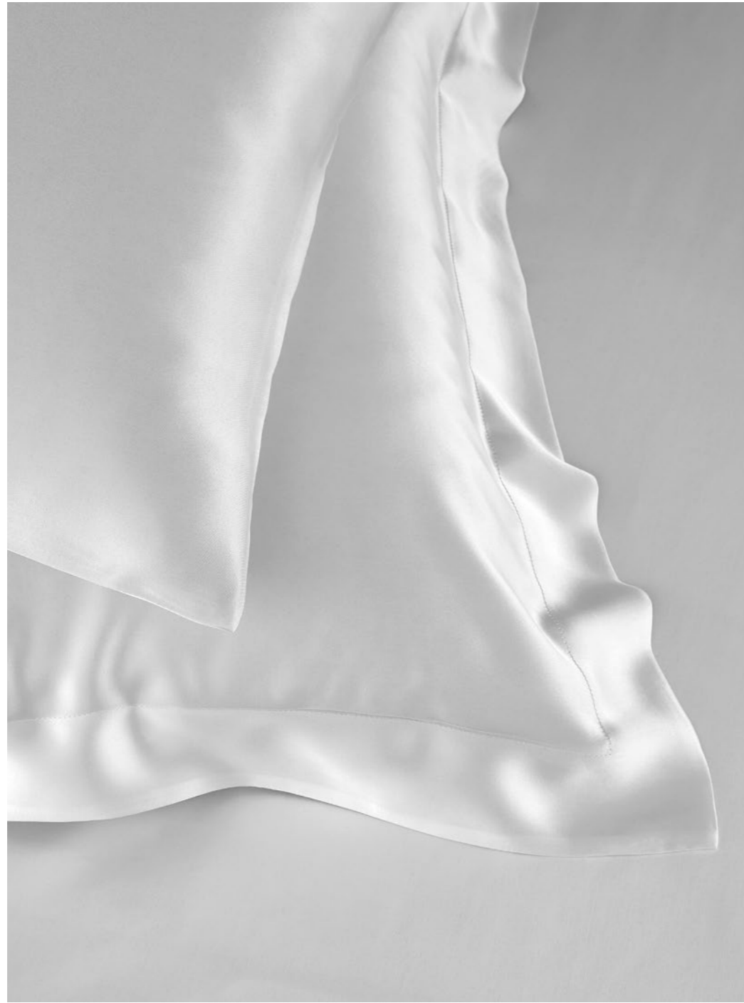
Silk Collection, Plain Design. White Colour.

Francesca Sateen, Large and Small Vertical Stripe Design, 100% Cotton, Mercerized. White colour.