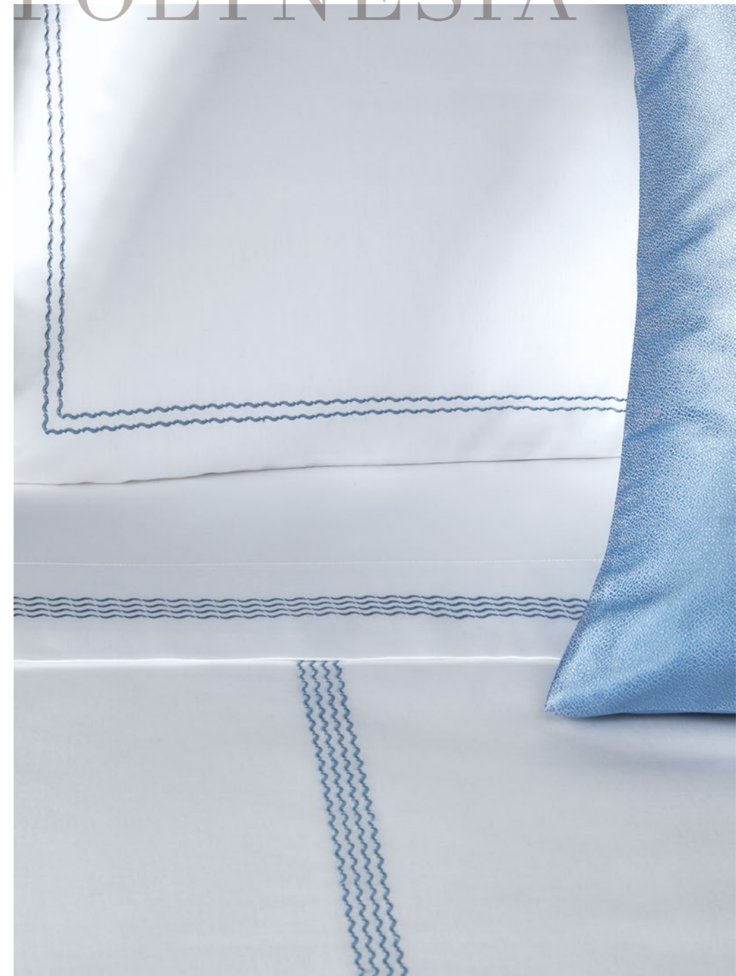
Smeraldo Sateen , Plain Design, 100% Cotton, Mercerized. White colour. Wave Embroidery. Partout Decorative Cushion , 100% Polyester, White/Aqua colour. Lucia Throw , Wool and cashmere throw with fringes on short sides. Aqua colour.