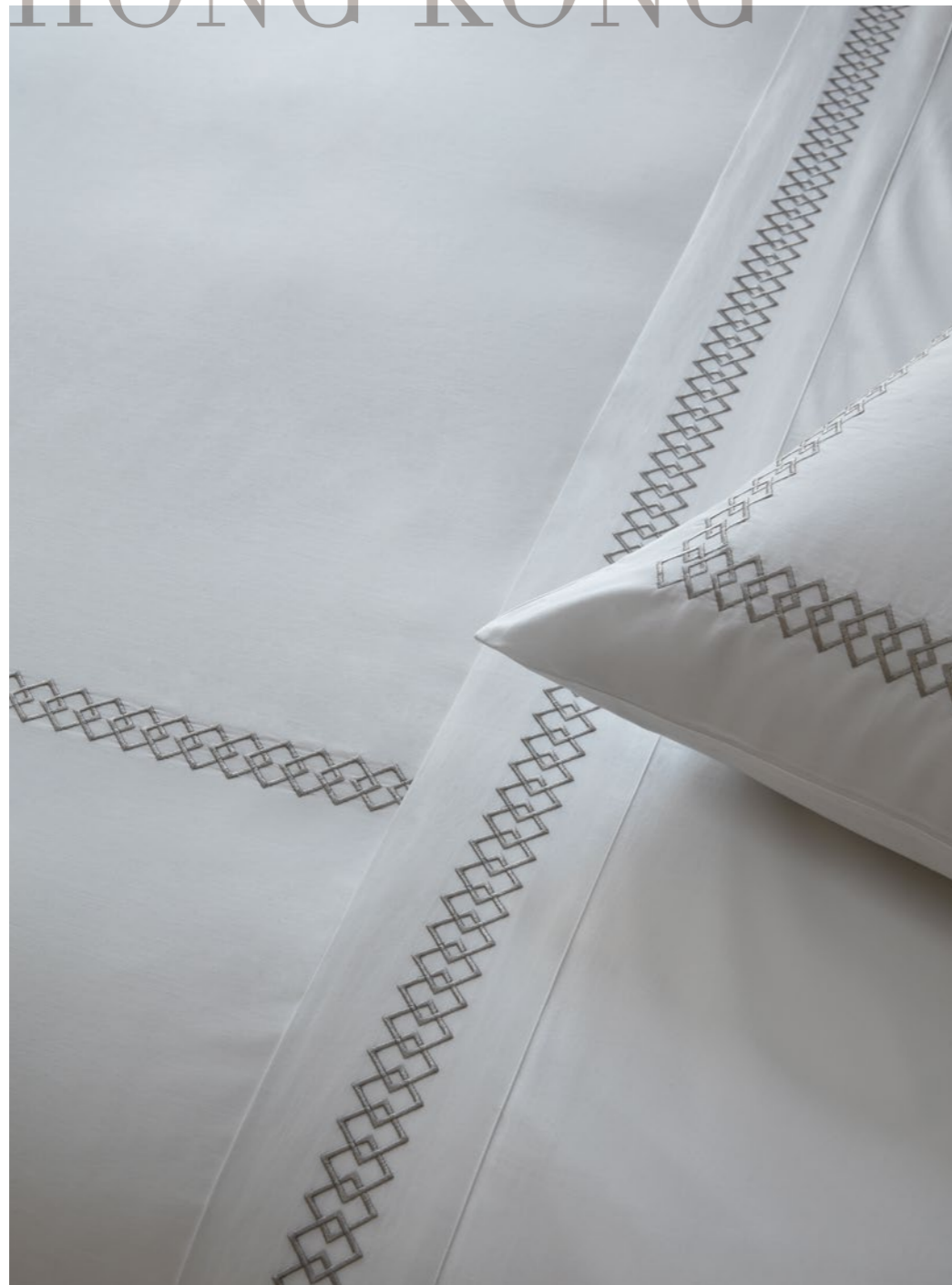
Smeraldo Sateen, Plain Design, 100% Cotton, Mercerized. White colour. Rhomb Embroidery.