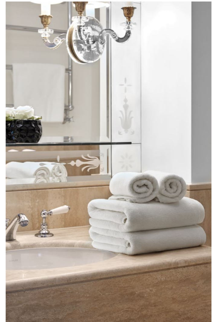
Nico Towel Set , 100% Cotton, Single Twisted Terry, Pique Border. White colour. Velour Bathrobe , 100% Cotton, White colour. Huckaback Towel , 100% Cotton, Single Twisted.