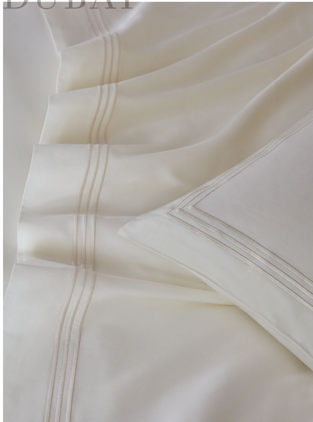
Smeraldo Sateen, Plain Design, 100% Cotton, Mercerized. Ivory colour. Three lines of piping. Ravenna Decorative Cushion, 100% Cotton Pique, Mercerized. Ivory colour.