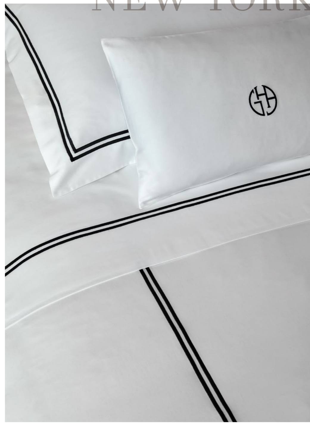
Smeraldo Sateen, Plain Design, 100% Cotton, Mercerized. White colour. Two lines of piping. Velvet Decorative Cushion, 100% Polyester, Black colour. Tetris Decorative Cushion, Cotton/Polyester, Black/White colour. Lucia Throw, Wool and cashmere throw with fringes on short sides. Black colour.