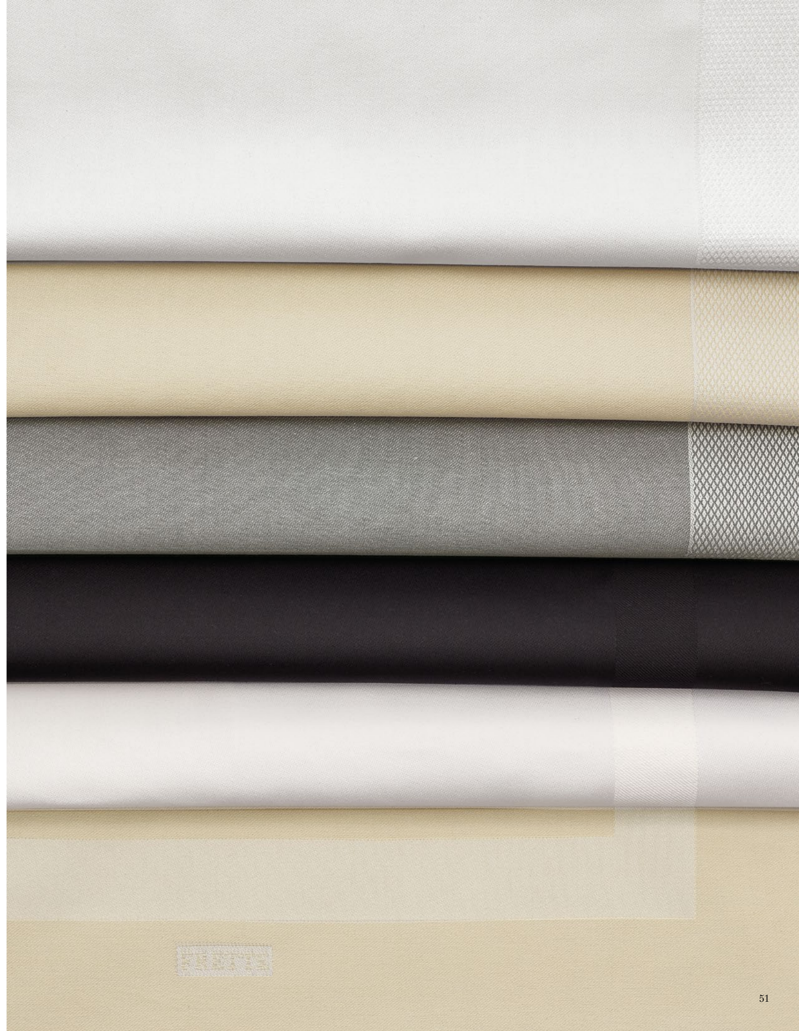
Satin Band Bordo Cornice Table Linen , 100% Cotton, Damask, Double Twisted, Mercerized. White and Half-Tone Ivory Vat colours.