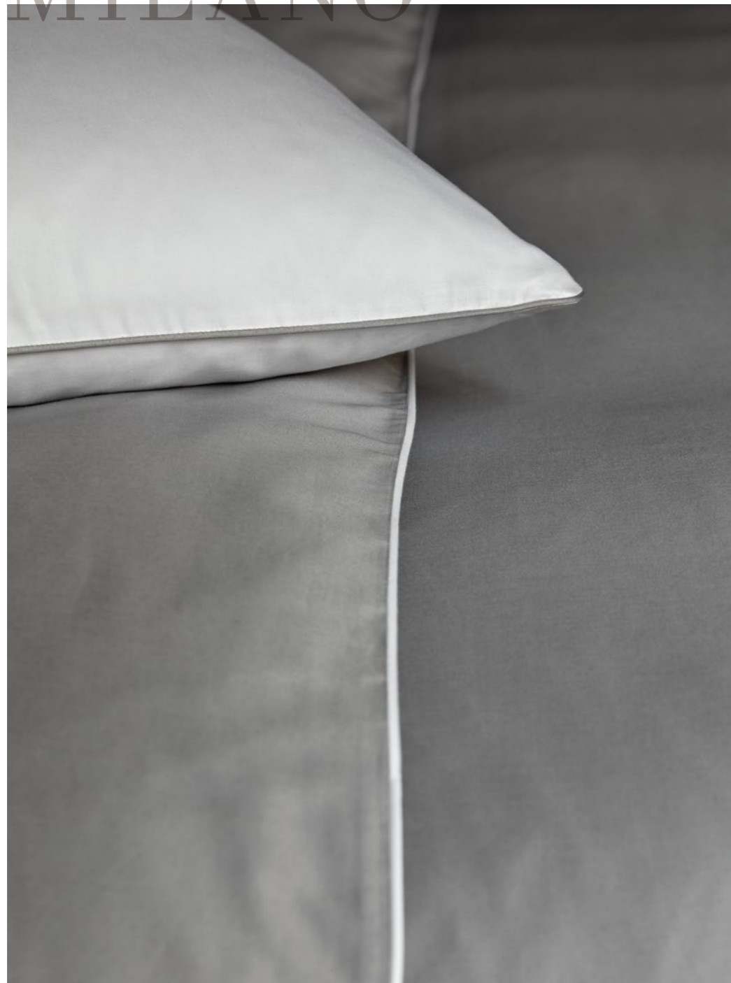
Smeraldo Sateen , Plain Design, 100% Cotton, Mercerized. Trim on edges. Slate Grey and White colours. Quilted Velvet Decorative Cushion , 100% Polyester, Slate Grey colour.