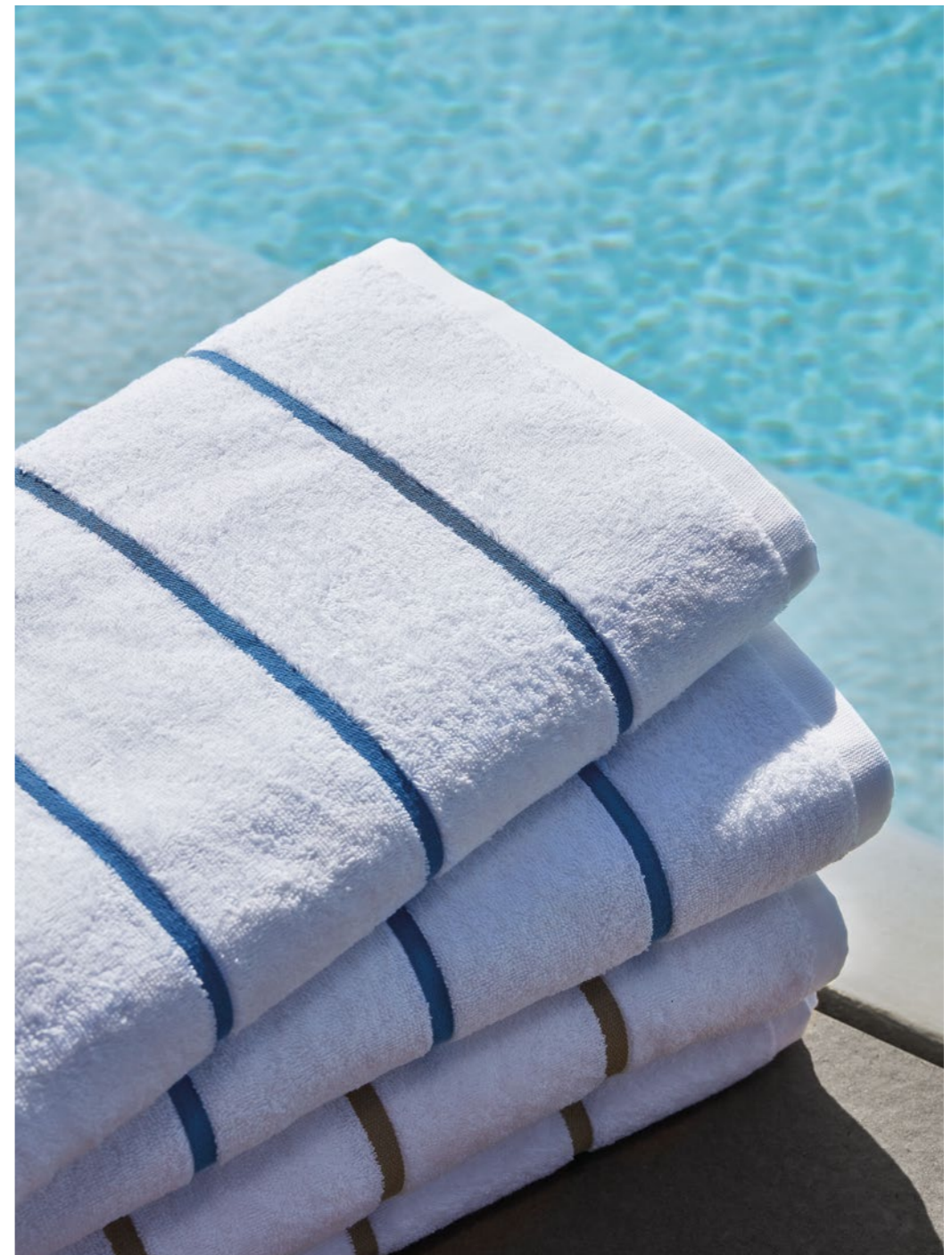
Striped Pool Towel, 100% Cotton, Pique Border, Double Twisted Terry. Beige Stripes and Blue Stripes colours.