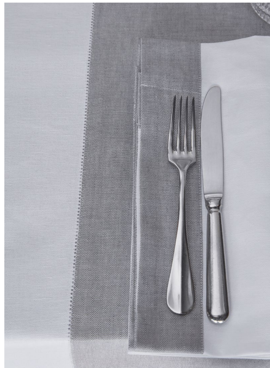
Benaco Tablecloth and Napkins. Linen/Cotton, Plain Weave. Applied Border and Hemstitch. White and Grey colour.