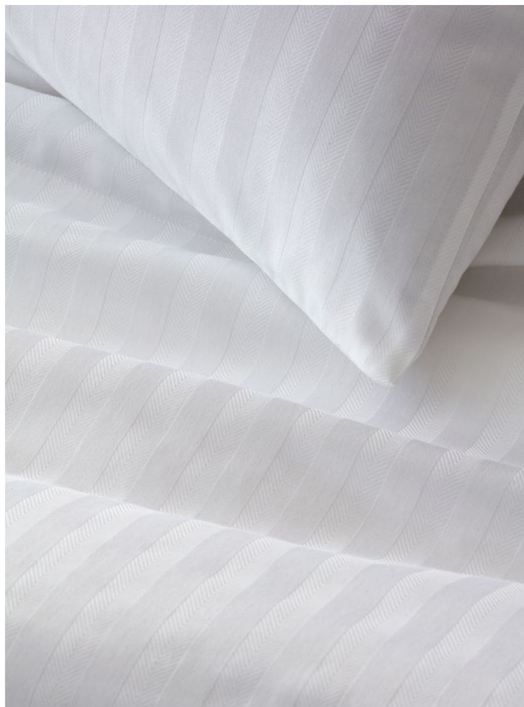
Ratière Sateen, Plain and Twill Large Vertical Stripe Design. 100% Cotton, Mercerized. White colour. Lucia Throw, Wool and cashmere throw with fringes on short sides. Grey Cliff colour.