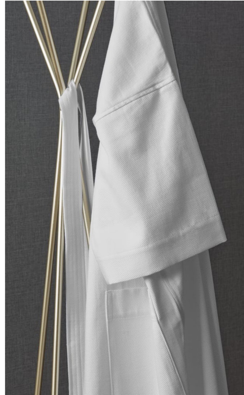
Jersey Hooded Bathrobe , Polyester on outside, Cotton on reverse. Grey colour. Fluffy Hooded Bathrobe , Polyester Microfiber Terry. White colour. Pique Kimono Bathrobe , 100% Cotton, Pique. White colour. Lanes Towel Set and Bath Mat , 100% Cotton, Double Twisted Terry, Dobby Border, Lanes Design at both ends. White colour. Suite Jacquard Stripe Bathrobe , 100% Cotton. White colour.